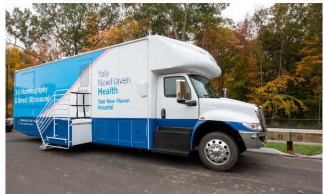
Yale New Haven Health 3-D Mammography and Breast Ultrasound Van

Appointments for screening mammograms have been added, and the wait time has been significantly reduced. A patient, in a post-survey, recently commented she was very pleased that she was able to get an appointment within a week's time, as she had been told by her gynecologist she may have to wait months. Appointments are now available in the evenings until 8 pm, and Saturdays and Sundays, 8 am – 4 pm. If a patient also needs an ultrasound, timely appointments for ultrasound only are available at all of our locations.