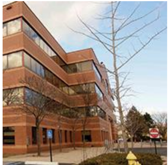
Yale New Haven Health, North Haven Medical Center, 6 Devine Street, North Haven

The new center will also house a COVID-19 recovery program, which will address post-COVID-19 symptoms and complications, including changes in memory, cardiac abnormalities, blood clotting disorders and mood changes.